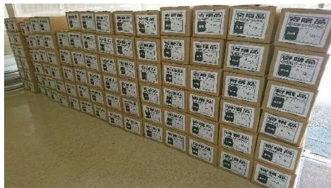
Social contribution through donation of food