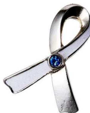
A White Ribbon pin badge, 2020