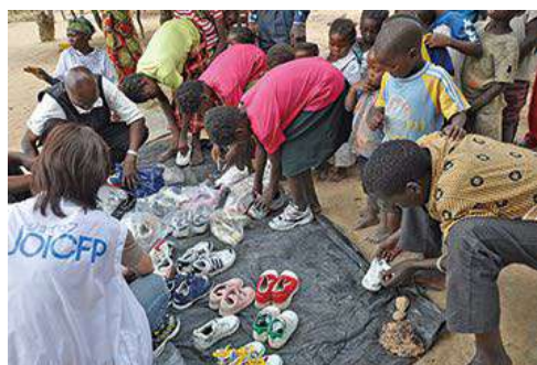
Children in Zambia choosing from the donated shoes

※ JOICFP is an NGO working for international cooperation that was started in Japan to protect the health and lives of women and children in the developing world.