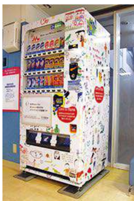
A White Ribbon beverage vending machine