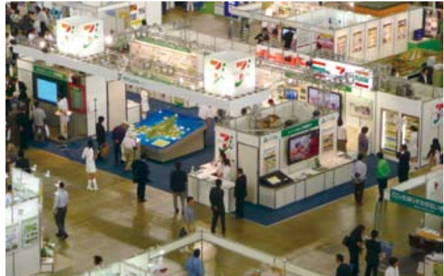
From June 19 to 21, 2008, we had an exhibit at the 2008 Exhibition on the Environment in Hokkaido.