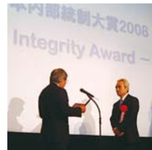
Seven & i Holdings received the grand prize at the Japan Internal Control Awards 2008—the Integrity Award

We fully explain these guidelines to business partners to help them understand our CSR philosophy. We have also set up a helpline exclusively for our business partners so that they can have their questions answered and opinions heard. The helpline is managed by a third-party organization to ensure responses are fair and independent.