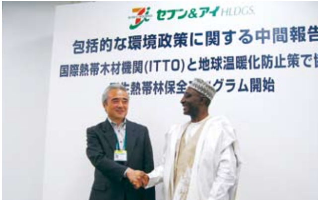
In June 2008, through the U.N.'s ITTO (International Tropical Timber Organization), we decided to contribute to a tropical forest conservation program that is linked to reduced CO2 emissions.