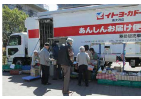
Truck used for the Ito-Yokado Anshin Delivery mobile

IY also provides the Ito-Yokado Anshin Delivery mobile store service at five stores in Nagano Prefecture, Sapporo City, Tama City, Hanamaki City and Iwaki City. This service also uses proprietarily developed trucks equipped with store facilities to visit communities that do not have easy access to stores for daily shopping or that have a large population of seniors who have trouble getting to stores.