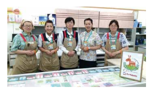
A display to notify customers that cognitive impairment supporters are in store

Each Group company holds training courses, and the number of supporters Groupwide had increased to about 10,200 as of August 31, 2015. We will strengthen our efforts to continue developing cognitive impairment supporters going forward.