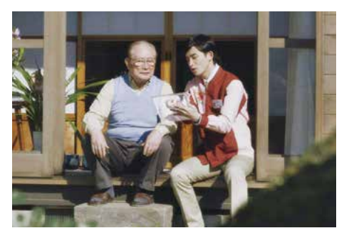
Shopping Support When Delivering Products

We have been working on sales methods and product development in preparation for the full-scale launch of the Omni-Channel in autumn 2015. We are also steadily expanding our product lineups that meet customers' needs.