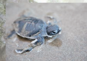
Visitors can participate in releasing sea turtles.

Suggested alternative means of earning incomes have included making full use of the national park as an ecotourism destination and selling medicines made from medicinal plants. Another proposal involves resuming the search for the Javan tiger, no sightings of which have been reported since 1997, as a symbolic project for the park. This proposal reflects the idea that employing the search for the tigers, which community members believe are still living in the forest, as a symbol for the project will attract attention both at home and abroad, which could help promote forest conservation efforts. With these suggestions under consideration, the project has been moving forward toward a new stage in its activities.