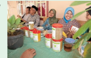
Developing and selling medicines made from medicinal plants

Suggestions from local communities have included raising cows to generate biomass energy from manure as a means of reducing the quantity of wood used as fuel and encouraging young people to learn English so they can earn incomes as tour guides. Others have expressed the opinion that they want to make their lives better by acquiring the know-how, methods and techniques employed in raising crops.