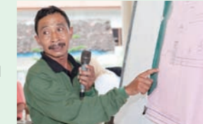
A forest ranger making a report

Some community members are assigned responsibility for planting trees in each area of the park, instilling them with a sense of responsibility. Others are appointed by the park to serve as forest rangers, who provide an auxiliary force backing up the official park rangers. They play such supporting roles as maintaining surveillance for illegal entry or logging and reporting violations to the park.