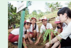
Elementary school children planting trees

Areas in which trees are planted are employed, moreover, as venues for local community education. Elementary school children who have studied about the MBNP in school pay personal visits to the park, where they plant trees, sometimes in the company of their parents. The trees they plant grow along with the children, which helps teach adult community members the importance