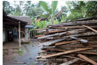
Large quantities of lumber are necessary for people's lives.