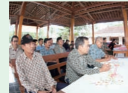
A discussion session in progress

Local community leaders gather for discussions in each area. Experts explain at these sessions that conserving forests is important, partly because exacerbation of climate change increases the incidence of malaria. Some have suggested that the residents generate income from alternative activities other than logging, such as pushing forward with reforestation and making medicine from plants.