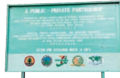
A signboard at the park entrance. The logos of all the project participants are posted.

Meru Betiri National Park is located in the southern region of East Java facing the Indian Ocean. Covering an area of about 58,000 hectares, the park features a rich ecosystem and a wide variety of vegetation, including an intact primary forest. Today, it is threatened by forest destruction and degradation, however, due to illegal encroachment and logging.