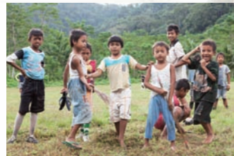
The park includes an area designated for human habitation within its boundaries.

The project is being implemented in cooperation with the Indonesian Ministry of Forestry, various research institutes, the MBNP, NGOs, the local government, the police, the ITTO, Seven & i Holdings and many other stakeholders. During the four-year period planned for the project's implementation, MBNP will seek to become a model REDD project in Indonesia in terms of "collaboration between the public and private sectors," "participation of various stakeholders" and "community-based planning and implementation."