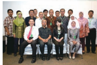
Participants in project steering committee meeting discussed ways to strengthen project implementation.

The project is being implemented in cooperation with the Indonesian Ministry of Forestry, various research institutes, the MBNP, NGOs, the local government, the police, the ITTO, Seven & i Holdings and many other stakeholders. During the four-year period planned for the project's implementation, MBNP will seek to become a model REDD project in Indonesia in terms of "collaboration between the public and private sectors," "participation of various stakeholders" and "community-based planning and implementation."