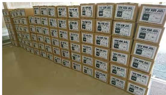
Social contribution through donation of food