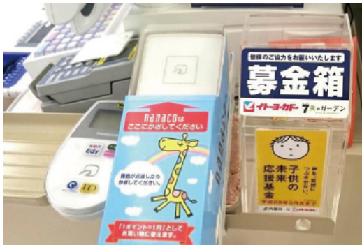
Donations accepted at approximately 6,000 POS registers