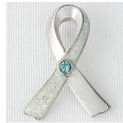
A White Ribbon pin badge