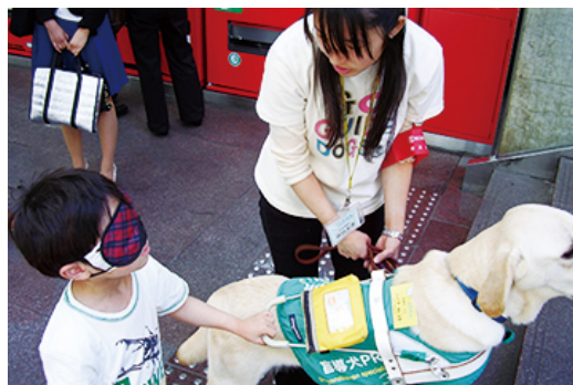
Campaign for coming in contact with guide dogs