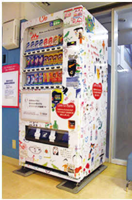
A White Ribbon beverage vending machine