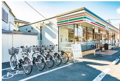
A store with a bicycle sharing site

Bicycle sharing allows for bicycles to be rented from any of multiple stations within a certain region. After use, a bicycle need not be returned to the original location and can be returned to the station closest to the user's destination. Bicycle sharing is expected to supplement public transportation in areas that lack adequate transportation and will play an important role as infrastructure.