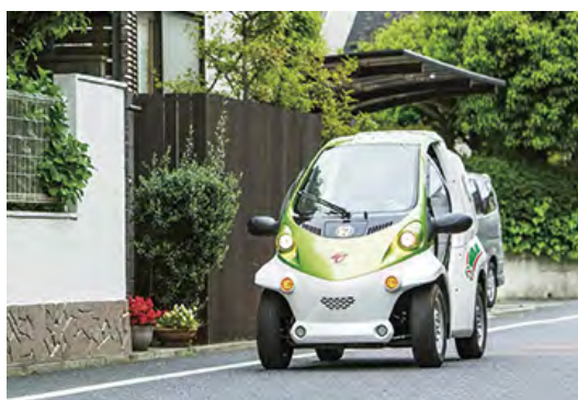
Seven RakuRaku Delivery

SEJ offers the Seven RakuRaku Delivery service, which provides home delivery for nearly every product sold in its stores. Orders can be placed in advance by telephone or through other means. The service operates a fleet of some 830 "COMS" ultrasmall electric vehicles and SEJ is also moving forward with the introduction of around 2,600 power assisted bicycles (as of February 28, 2018).