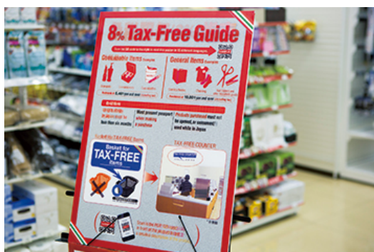
Tax-free service section

Moreover, Seven Bank ATMs offer cash withdrawal services on overseas-issued cards, while stores also offer free in-store Wi-Fi services Seven Spot in response to strong demand from overseas travelers.