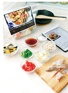
A Meal Kit from IY Fresh