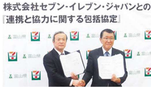
Ceremony to mark conclusion of a comprehensive alliance agreement with Toyama Prefecture

> For information regarding support during disasters, click here