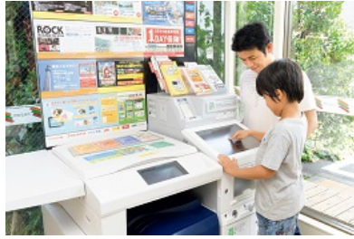
Multifunctional copier machines can copy print, issue various types of certificates, and even issue insurance policies.

7-Eleven stores became the first in the industry to offer motorcycle and bicycle insurance enrollment and insurance premium payment services where customers can enroll in insurance 24 hours a day by entering the necessary personal information on the multi-functional copier machine screen in store and paying their premium at the register. (The service is for motor scooters and motorcycles with an engine displacement of 250 cc or less, which do not require a motor vehicle inspection.) "1 DAY Insurance" providing automotive insurance coverage in one-day increments has been available at all 7-Eleven stores since September 2015, and "1 DAY Leisure Insurance" that provides necessary accident coverage when needed has been available since April 2018. 7-Eleven will continue to support the thriving lifestyles of customers by offering products tailored to customer needs.