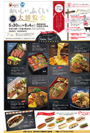
"Fukui Specialty Food Fair" held at the Seibu Fukui Store