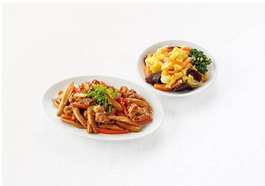
An Ingredient Set from Seven-Meal

In addition, easily-prepared meal kits from Ito-Yokado's IY Fresh service are also sold. These services have been well received by families with two working parents who have little time, as well as single-occupant households who don't want to waste food.