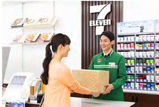
Shopping Support When Delivering Products

The Seven & i Holdings Group is working to realize an Omni7 where customers can order any of the Group's products and choose to pick them up from a local Group store or have them delivered to their homes, as well as return unwanted items. In addition to sales at stores, customers can also order products using their PC or smartphone.