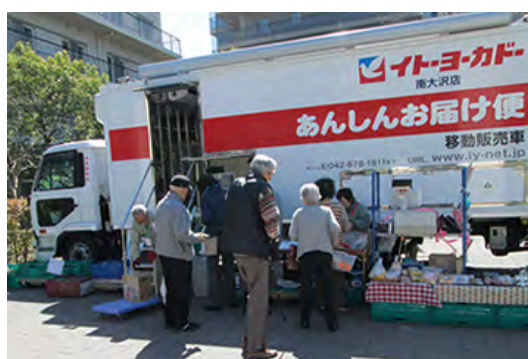
Ito-Yokado Anshin Delivery

IY also uses its own specially developed trucks equipped with store facilities to provide the Ito-Yokado Anshin Delivery mobile store service at five stores in Nagano Prefecture, Sapporo City, Tama City, Hanamaki City, and Iwaki City (as of February 28, 2018).