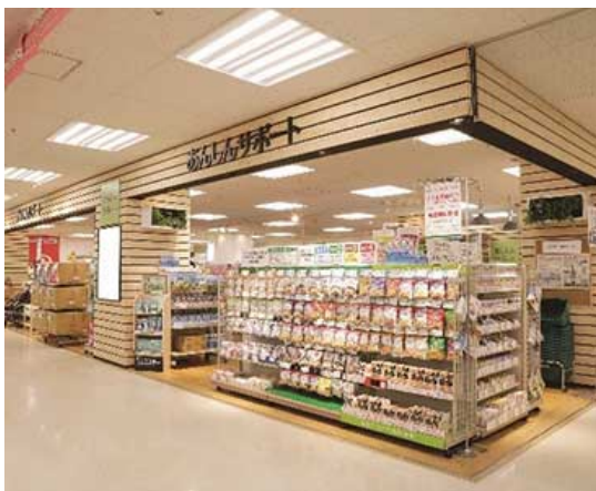
Anshin Support Shop

In addition, Sogo & Seibu has teamed up with the Caring Design Association to establish a permanent “Living Design Salon” at the Seibu Ikebukuro Store for supporting living and home design for customers aged in their 50s and above. The facility proposes appealing homes that casually incorporate care and support features for the physical changes that occur with age, aiming to enable people to live in their own way even as they grow older.