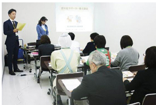
Cognitive impairment supporter training