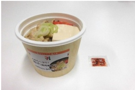
Oniku Tappuri! Pork Miso Soup sold at 7-Eleven stores in the Nagano region

The Seven & i Group makes use of comprehensive alliance agreements to promote various regional revitalization initiatives with respective local governments. SEJ recognizes the importance of local flavors and food cultures by developing products that use local ingredients. IY, Sogo & Seibu, York-Benimaru, and other Group companies propose menus using local products and ingredients, helping to support regional revitalization by promoting the appeal of the local area.