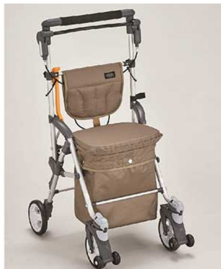
The Silver Car pushcart for seniors that can be pushed over uneven surfaces