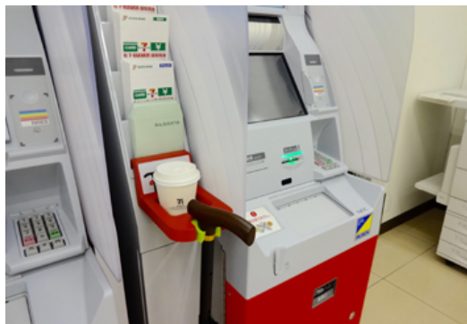
ATM with cane and drink holder installed