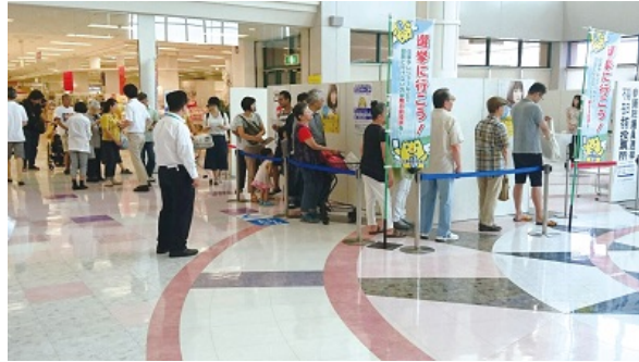
A polling booth set up in an Ito-Yokado store

IY and Sogo & Seibu provide facilities within stores to be used free of charge for use as polling booths in cooperation with local governments to provide voters with easily accessible polling booths that are handy to shopping facilities. Local governments seek to increase the voting rate due to the reduction in number of polling booths and decline in voting rate due to the merger of municipalities, in addition to the enactment of the revised Public Offices Election Act, which lowered the voting age to 18. The booths are used to provide easy access to voters while they are shopping. During the fiscal year ended February 28, 2018, polling booths were set up in 21 Ito-Yokado stores and four Sogo & Seibu stores, and election promotion activities were conducted in the stores, such as displaying posters, in-store announcements and printing the election date on receipts.