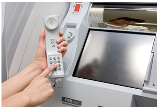
Voice guidance service

* Banks, credit unions, credit cooperatives, labor banks, JA banks, JF Marine banks, and securities companies that are partners with Seven Bank. This service is not offered for insurance companies or credit card companies, even if they are a partner of Seven Bank.