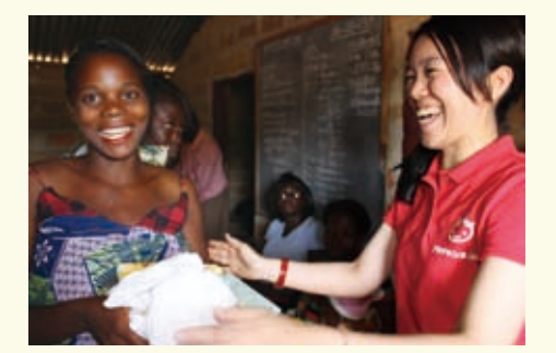
Akachan Honpo managers visiting a distribution site in Zambia

In addition, since April 2010 Akachan Honpo has been implementing an ongoing program whereby Akachan Honpo customers can donate baby underwear and other baby clothes that they no longer need, which are then distributed by JOICFP for use by babies in need in Zambia. Some of the donated baby-wear is distributed at the travelling clinics for pregnant women and babies that JOICFP organizes, while others are used at the Maternity Waiting Houses that JOICFP has been setting up in Zambia. (As of the end of February 2014, this donation project was being implemented in 25 Akachan Honpo stores)