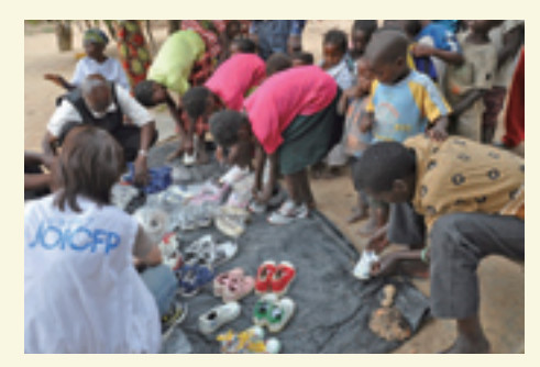
Shoes being distributed to children in Zambia.

Children's Shoes Donation Areas have been installed in every Sogo & Seibu store throughout Japan. Through Seven & i Holdings' collaboration with the Japanese Organization for International Cooperation in Family Planning (JOICFP), the children's footwear donated by Sogo & Seibu customers are given to children living in the Republic of Zambia. These shoes help protect children from tetanus and parasitic infections resulting from foot injuries (which can be a serious problem for barefoot children). Over the period from 2009 to June 30, 2014, a total of 425,776 shoes had been distributed to children in Zambia. Starting from April 2014, Children's Shoe Donation Areas have also been established in Ito-Yokado stores.