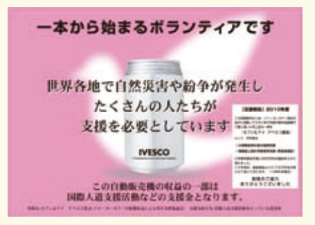
Vending Machine Activity Notifications

In June 2013, donations totaling 14.88 million yen (deriving from sales by 409 individual vending machines) were distributed to four organizations involved in international humanitarian aid work, including Plan Japan.